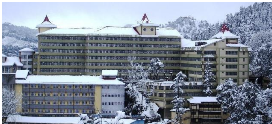
A VIEW OF I.G.M.C. SHIMLA