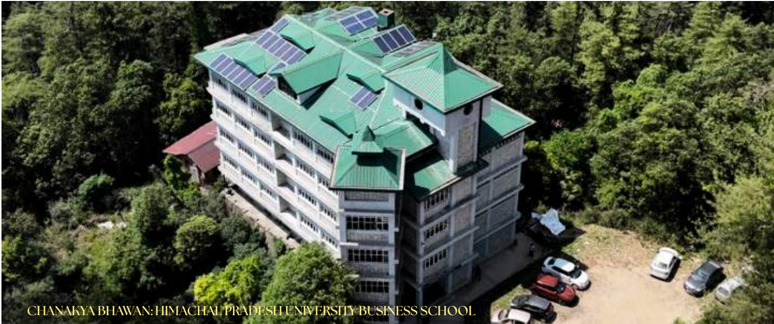
CHANAKYA BHAWAN: HIMACHAL PRADESH UNIVERSITY BUSINESS SCHOOL