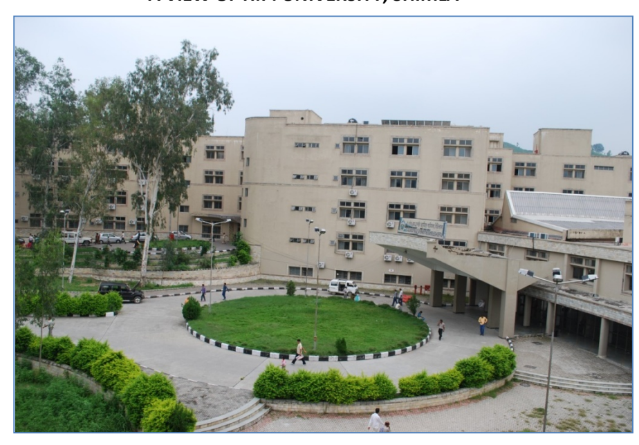
A VIEW OF Dr. R.P.G.M.C, TANDA AT KANGRA (H.P.)