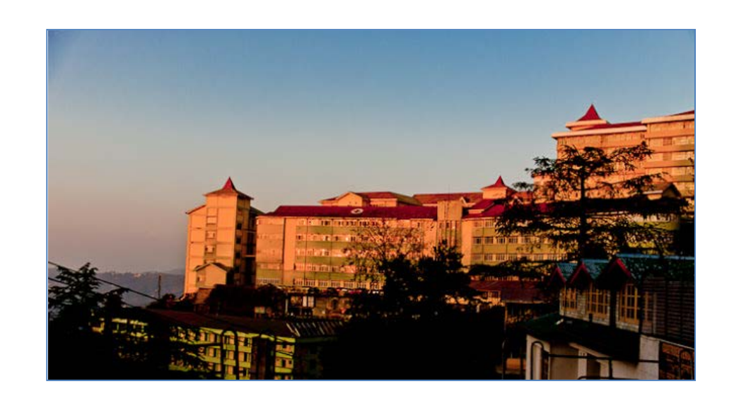
A VIEW OF I.G.M.C. SHIMLA